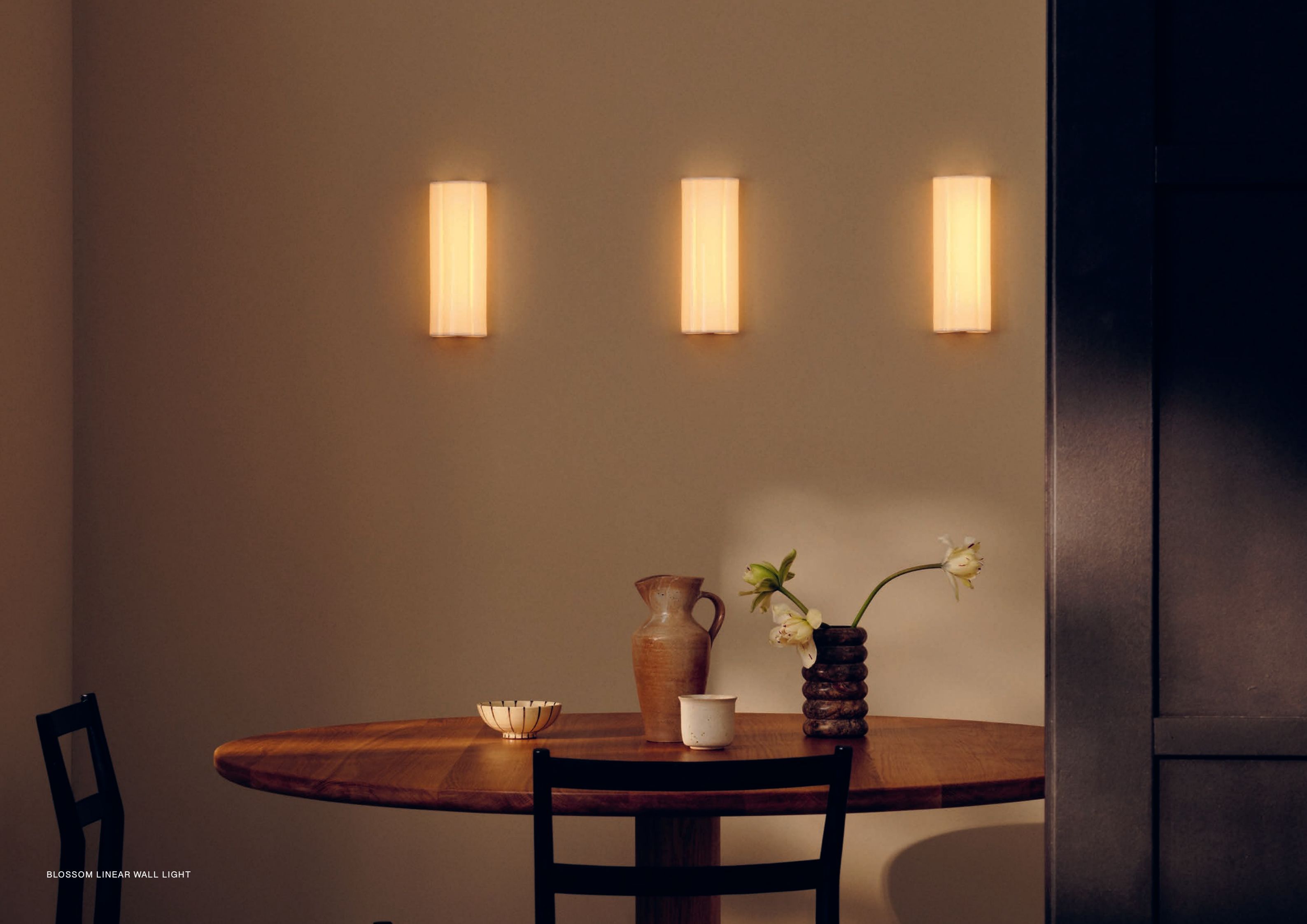
BLOSSOM LINEAR WALL LIGHT