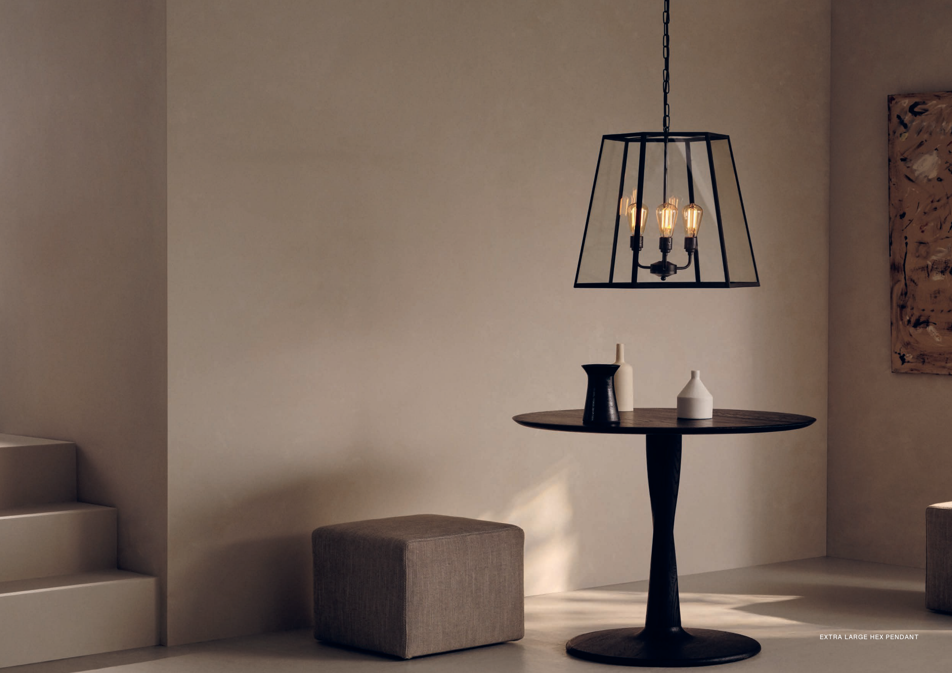
EXTRA LARGE HEX PENDANT