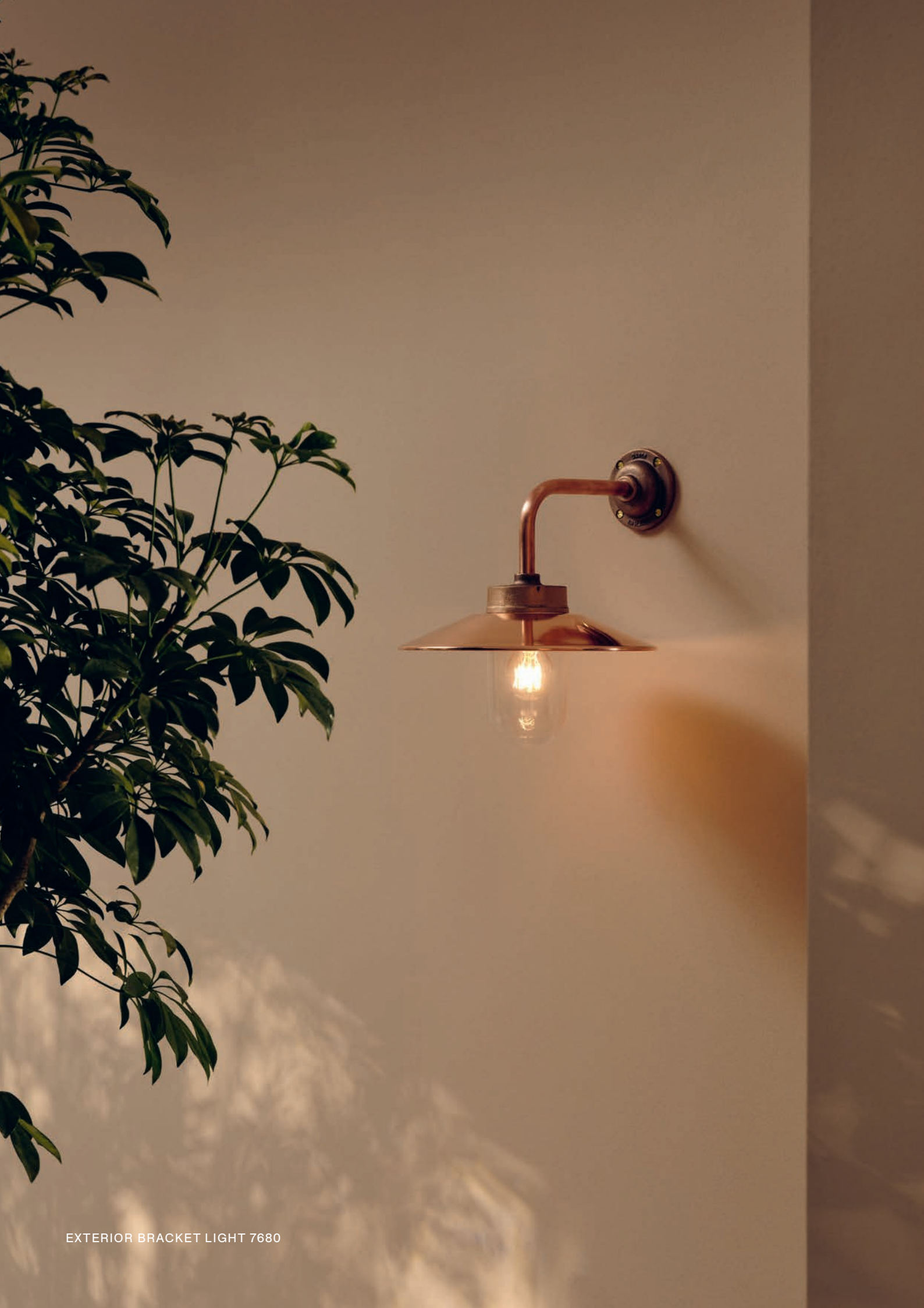
EXTERIOR BRACKET LIGHT 7680