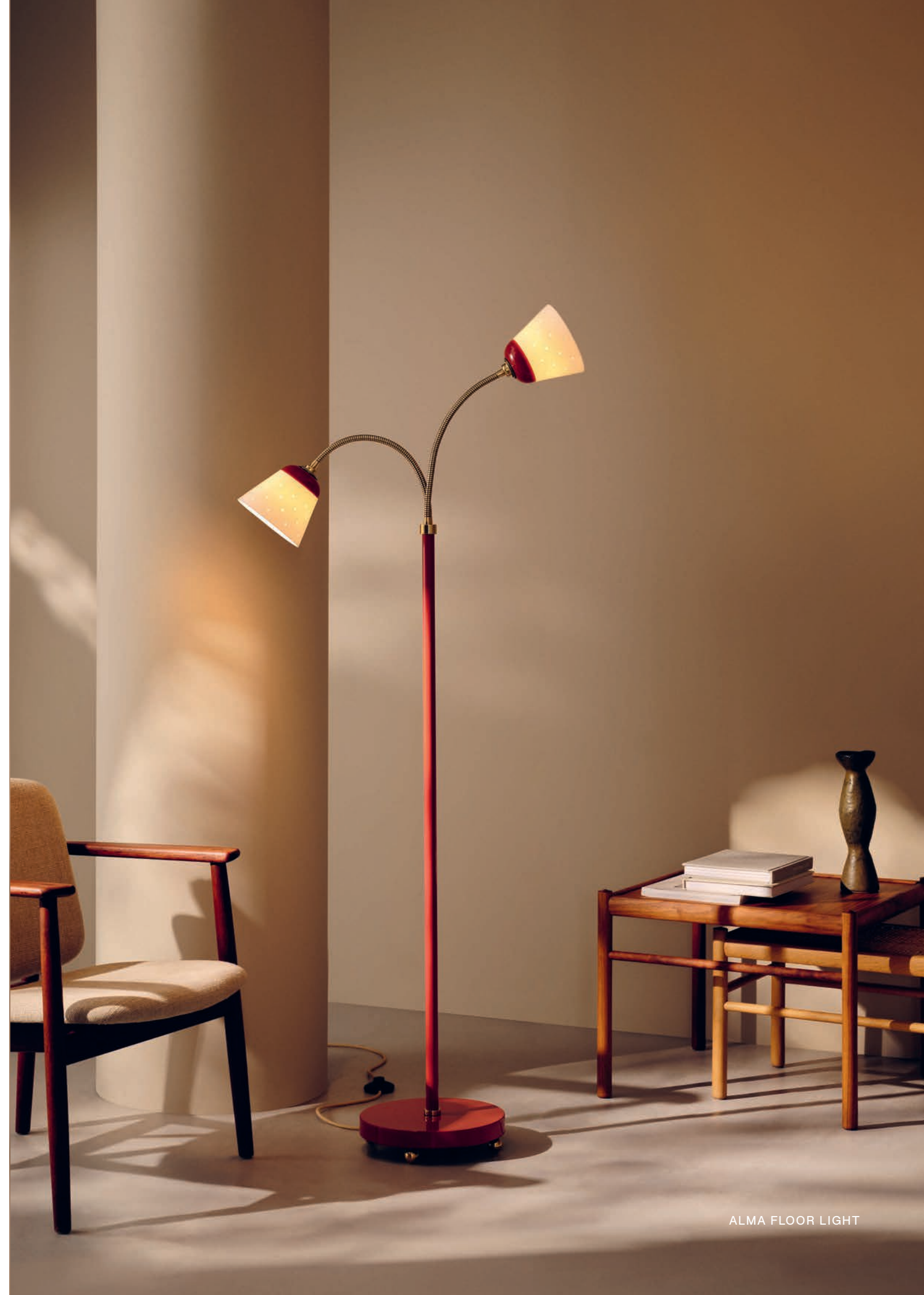
ALMA FLOOR LIGHT

Our passion spans both contemporary and heritage lighting. Whether developing new designs or preserving those dating back to the late 19th century, we remain dedicated to authenticity, longevity, and timeless appeal.