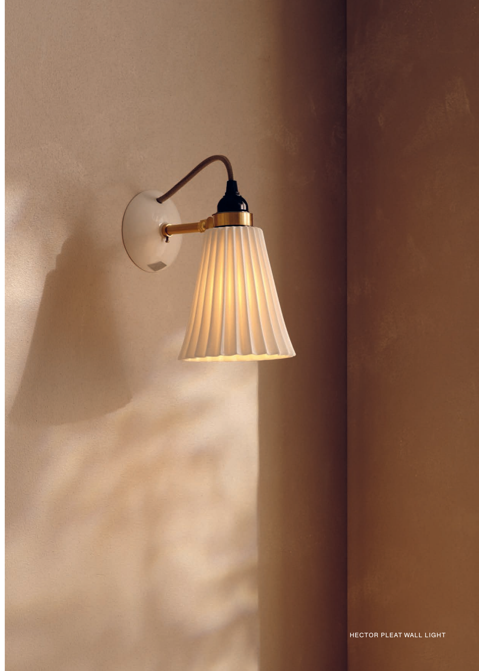
HECTOR PLEAT WALL LIGHT

All our products are handmade in England using traditional methods by skilled craftspeople. We offset all the carbon created in our offices, showrooms, and fulfilment facility. Wastage is kept to an absolute minimum, and we recycle directly back to the source.